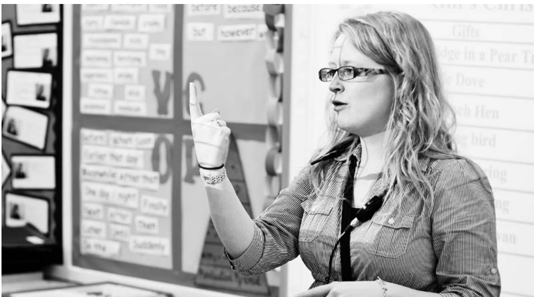
A tutor using a soundfield system (the tutor is wearing the microphone).

A soundfield system can make it easier for a student to hear your voice wherever you are in the room. Your voice is transmitted via a microphone to a base station placed within the room. This amplifies and enhances the speech and then broadcasts it from speakers positioned around the room. Portable systems are available which can be moved from room to room.