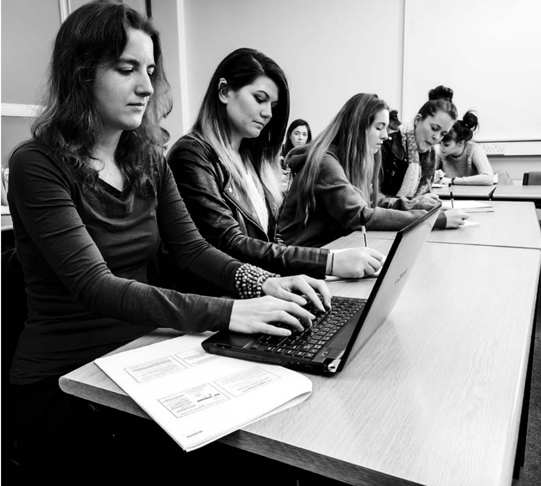
An electronic notetaker supports a deaf young person in a seminar.

If the student requires a word-for-word account of a lecture or seminar then they may use a speech-to-text reporter (otherwise known as a palantypist) who is able to type at the speed of normal speech. This can be provided remotely with the reporter listening in via Skype (or similar software) and the transcript being provided through a web page.